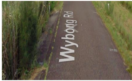
8. Wybong Road (Major Culvert)