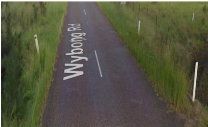
7. Wybong Road (Major Culvert)