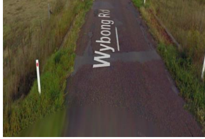
2. Wybong Road (Major Culvert)