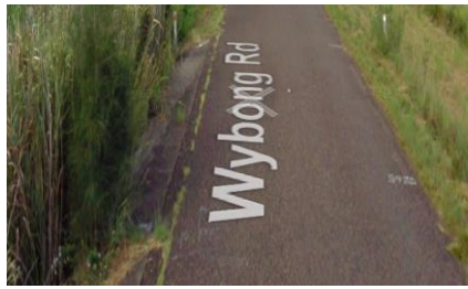
8. Wybong Road (Major Culvert)