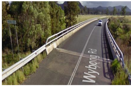
5. Wybong Road (Wybong Bridge)