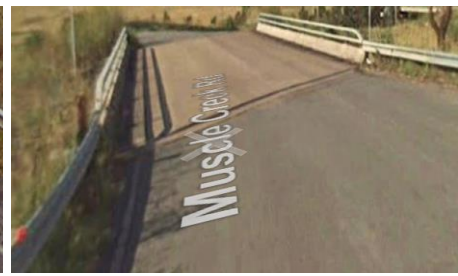
12. Muscle Creek Road (Rail Bridge)