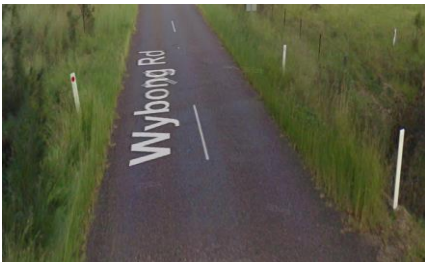
7. Wybong Road (Major Culvert)