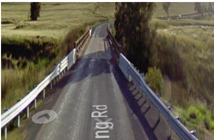
4. Wybong Road (Spring Creek Bridge)