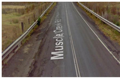
11. Muscle Creek Road (Major Culvert)