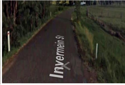
17. Kayuga Road (Major Culvert)