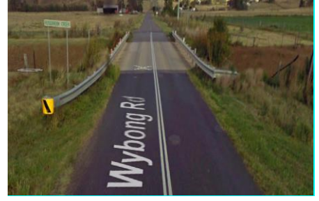
3. Wybong Road (Rosebrook Bridge)