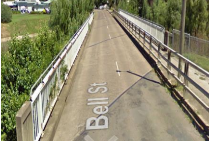
1. Bell Street (Muscle Creek Bridge)