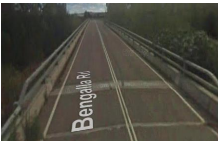
13. Bengalla Road (Keys Bridge)