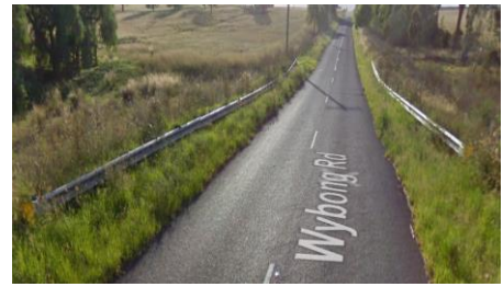
9. Wybong Road (Major Culvert)