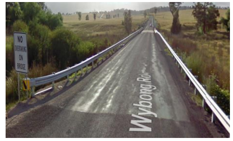
6. Wybong Road (Sandy Creek Bridge)