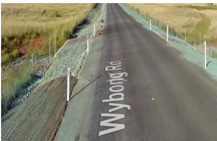
10. Wybong Road (Major Culvert)