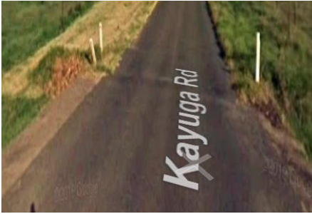
16. Kayuga Road (Major Culvert)