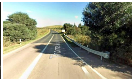
15. Thomas Mitchell Drive (Major Culvert)