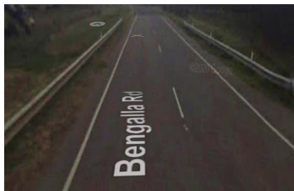
14. Bengalla Road (Major Culvert)