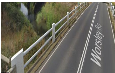
10. Worsley Road (Eumemmering Creek Drain)