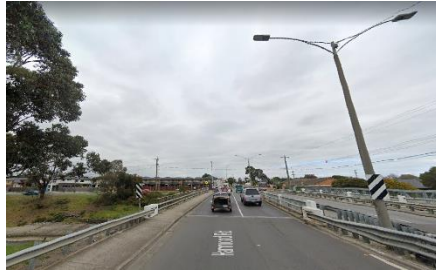
2. Hammond Road Bridge (Dandenong Creek- Easterly)