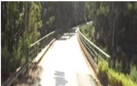
4. Abbotts Road (Greens Rd Drain)