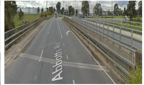
3. Abbotts Road (Eumemmering Creek)