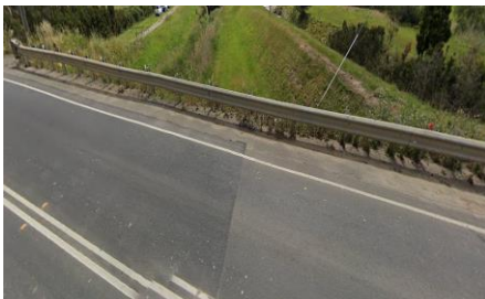
7. Perry Road (Mordialloc Drain)