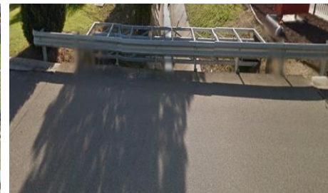
9. Healy Road