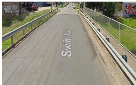
8. Swift Way