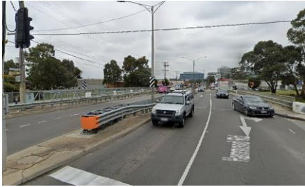
1. Hammond Road Bridge (Dandenong Creek- Westerly)