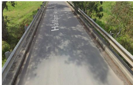
5. Hallam-Valley Road (Eumemmering Creek)