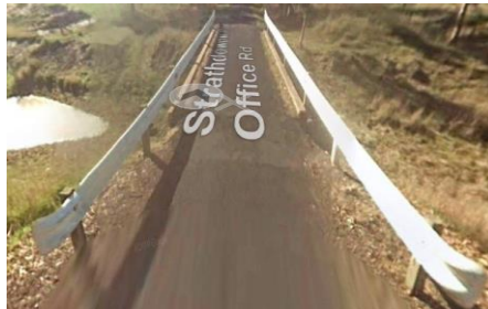
8. Strathdownie Post Office Road (Limestone Creek)