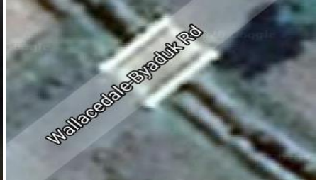
3. Wallacedale Byaduk Road (Charcoal Creek)