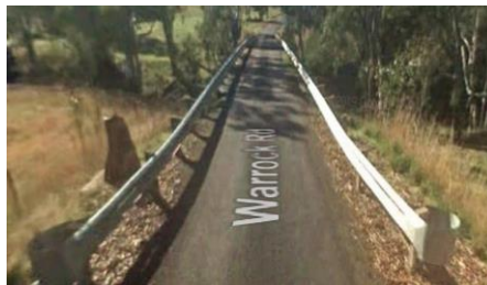
5. Warrock Road (Glenelg River)