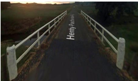
4. Henty Paschendale Road (Henty Creek)