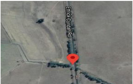
7. Condah Ettrick Road (Breakaway Creek)