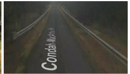
6. Condah Macarthur Road (Drain to Condah Swamp)