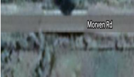
1. Morven Road (Crawford River Bridge)