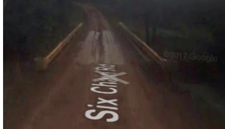
2. Six Chain Rd (Dwyers Creek)